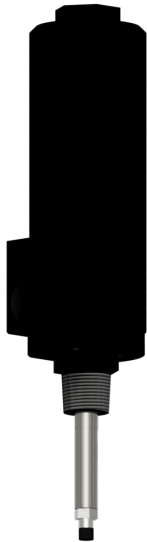
PRO Line reverse mount proximity probe housing assembly allows eddy current probes to be mounted as deeply into machines as 29.2 inches

Easily adjust the gap between the machine shaft and probe without shutting down a machine.